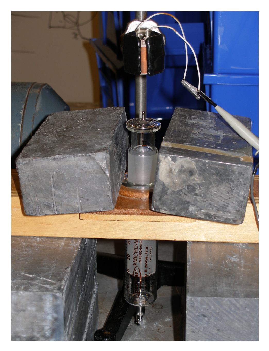
Figure 1: Photo of experimental apparatus